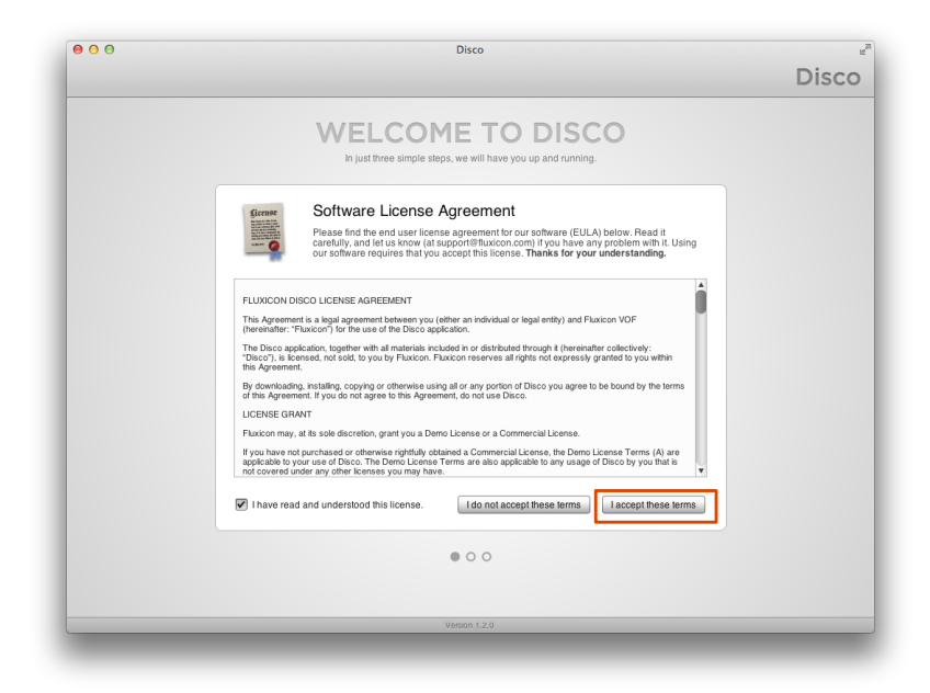
Fig. 1.4. Step 1 out of 3: Accept Disco's software license agreement.

4 1 Installation Instructions for Academic Partners