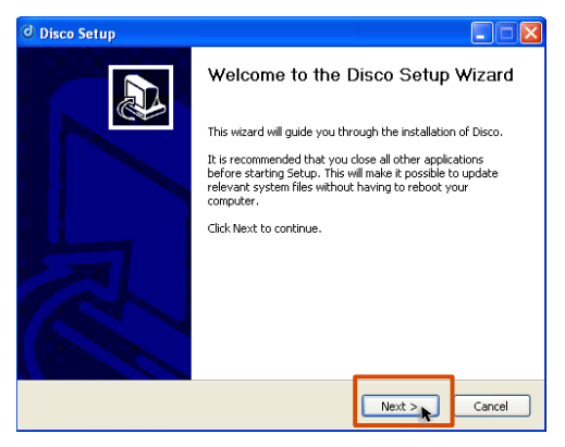
(b) Click Next to continue with the installation.

(a) Click Run to start the Disco installer.